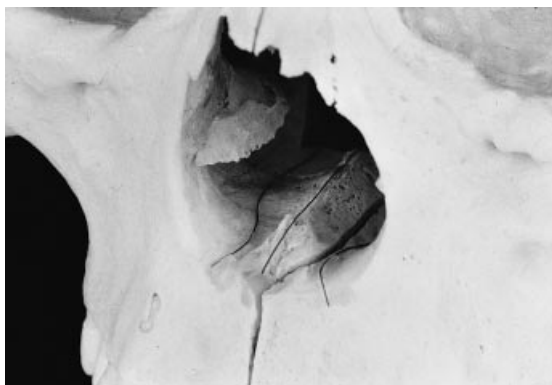
Figure 2 Wire-marked skull: two wires were placed, one on either side of the nasal spine onto the nasal floor, and a third wire onto the nasal crest.

three skulls were radiographed. Subsequently, they were marked with wires and radiographed again. Two wires were placed on the nasal floor, one on either side of the nasal spine, and a third wire was placed on top of the nasal crest (Figure 2). The radiographs with and without wires were then compared in order to observe the differences between the apparent borders of bone structures on the radiograph and the effective borders as indicated by the wires.