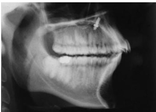
Figure 3 The post-operative cephalogram of a patient with a dental Class II division 1 malocclusion and anterior crowding. The treatment goal was extraction of the first premolars and retraction and alignment of the anterior teeth with bilateral maximal posterior anchorage. No projection of the implant into the nasal sinus and no perforation on probing were found.

perforation to the nasal cavity in any patient of this group.