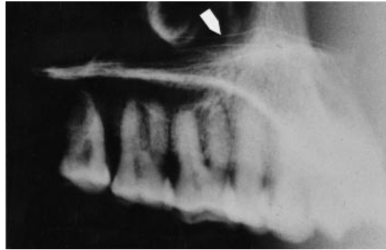
Figure 5 Lateral cephalogram of the wire-marked skull (cf. Figure 2). The wire on the crest (arrow) seems to be suspended in the air since the crest is not visible on the projection.

The mid-sagittal area of the palate is a valuable insertion site for implants in order to provide a stable point for orthodontic correction in the maxilla in subjects with a full dentition or where spaces are to be closed. With respect to the given limitations in bone height a study was carried out, based on clinical and radiological data obtained during and after insertion of implants, which were placed in the anterior and middle sections of the mid-sagittal palate. The results suggest that sufficient vertical bone support is available in this area for implants of 4 and 6 mm endosseous length, and with a diameter of 3.3 mm. The results also show that vertical bone support is mid-sagittally at least 2 mm higher than indicated on the cephalograms. The angulation of the implant has a considerable influence