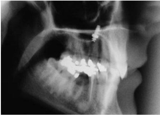
Figure 4 Post-operative cephalogram of a patient with a skeletal Class I and a dental Class II division 1 malocclusion. The treatment goals were distalization of the lateral teeth and torquing of the incisors. The implant projects into the nasal sinus, however, there was no perforation to the nasal sinus found during intra-operative probing.

position of the wires indicating nasal floor and nasal spine on the cephalogram were compared to the projection of borders of the hard palate (Figure 5). The radiologically visible MCBPC corresponds largely with the anatomical structure of the basal nasal cavity and not with the mid-sagittally situated nasal crest which offers additional vertical bone support.